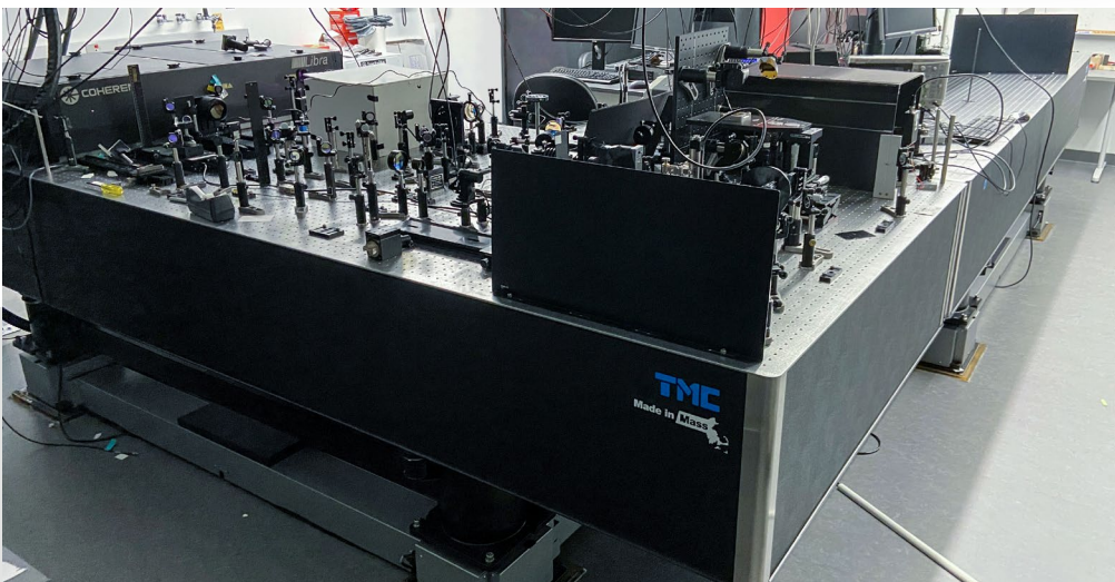
Shown is the LaserTable-Base with the L-shaped design that's used by the Ultrafast THz and Optical Spectroscopy Lab at WPI.

The LaserTable-Base base made these vibration concerns irrelevant. In addition to enjoying temperature and humidity control suitable for its experiments, the lab is now able to replicate the same vibration isolation it used to achieve from the solid floor in the basement of the former building. The lab group can now run experiments whenever they choose and be sure they are protected from external vibration.